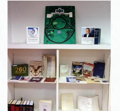
What You Say:

Not a lot of space would be needed, try to negotiate with administration