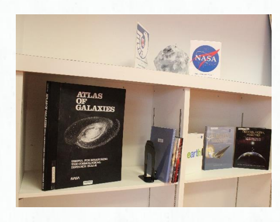
What You Say:

Offer trial periods, 2-3 months, when needed, and emphasize that this is FREE material paid by tax payers