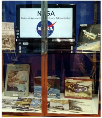
Showcasing government resources for the public with a display of books, flyers and posters.