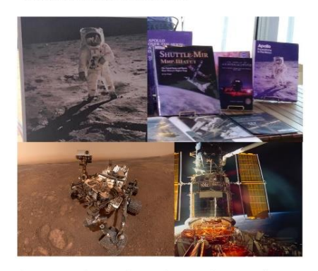
The Space City loves exploring the past and present of NASA