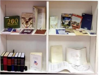
Did you know that the White House has a garden? That Each president has had their papers published? Book display celebrating Presidents' Day