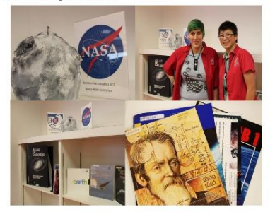
NASA Display in July promoting space, travel and science technology

The Government Documents collection is a closed-stack, noncirculating collection.