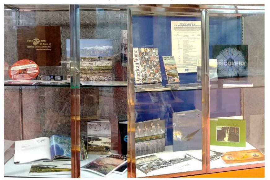
HPL's 135 years in FDLP: Highlighting books, posters & other items published by the GPO on history, military defense & NASA