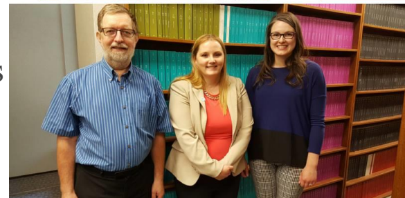
0454 North Dakota Supreme Court Law Lib