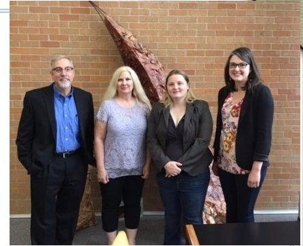
0571 South Dakota State University 0296 Carleton College (MN)