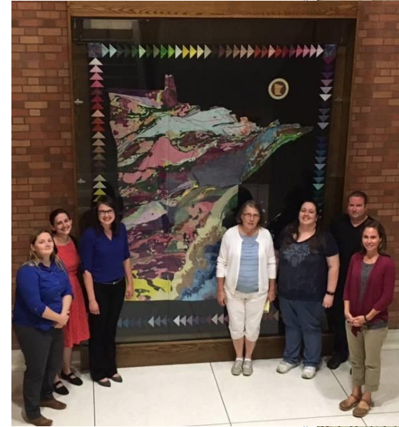
0295 University of Minnesota Gov Pubs Library