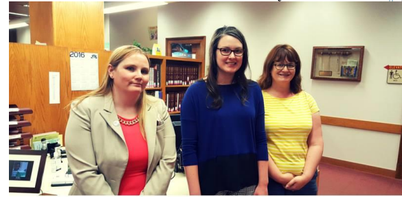
0457A North Dakota State Library