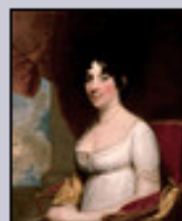
Dolley Payne Madison Gilbert Stuart