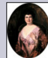
Edith Bolling Galt Wilson Adolfo Müller-Ury