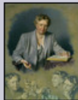
Anna Eleanor Roosevelt Roosevelt Douglas Chandor