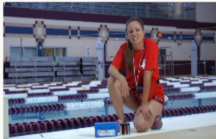
Lifeguard Drain Cover Training Got It Covered