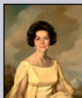
Claudia (Lady Bird) Taylor Johnson Elizabeth Shoumatoff