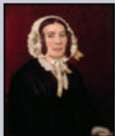
Abigail Powers Fillmore Unknown Artist