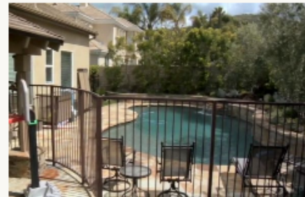
Simple Steps to Safer Pools