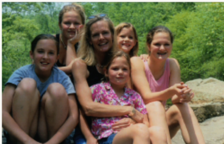
VGB Compliance Guides Series Introduction