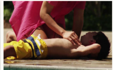
Simple Steps Saves Lives Series