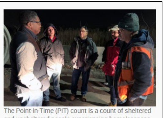
and unsheltered people experiencing homelessness required by HUD.

Among homeless, deaths rise News Source Date: December 31, 2020