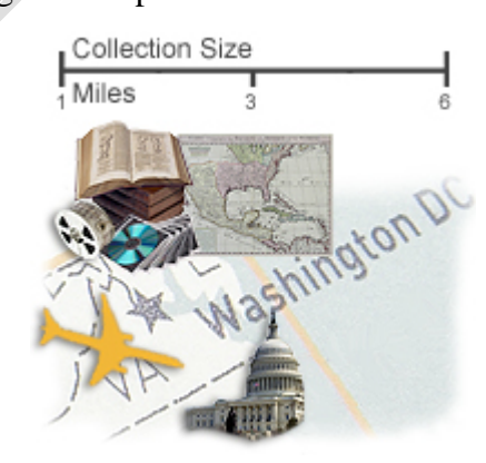
When lined up, materials in a 100 year old regional depository stretch six miles or slightly farther than the distance from the U.S. Senate Library to Reagan National Airport.

decrease or static number of librarians in depository operations over the last five years. Depository staff in 78% of regionals is training staff throughout the library about reference sources and services for Government information. This is critical as depositories are also reorganizing; a majority (58%) of regionals has integrated their service desk with that of the library's main reference area and most depository librarians are no longer responsible for only depository operations. Crosstraining activities leverage shrinking staff resources and enhance public service to users. Yet the regional librarians, in the joint perspective<sup>3</sup> they submitted to GPO, reported that this leads to a "generalist" approach to service and in-depth expertise diminishes over time with retirements and downsizing.