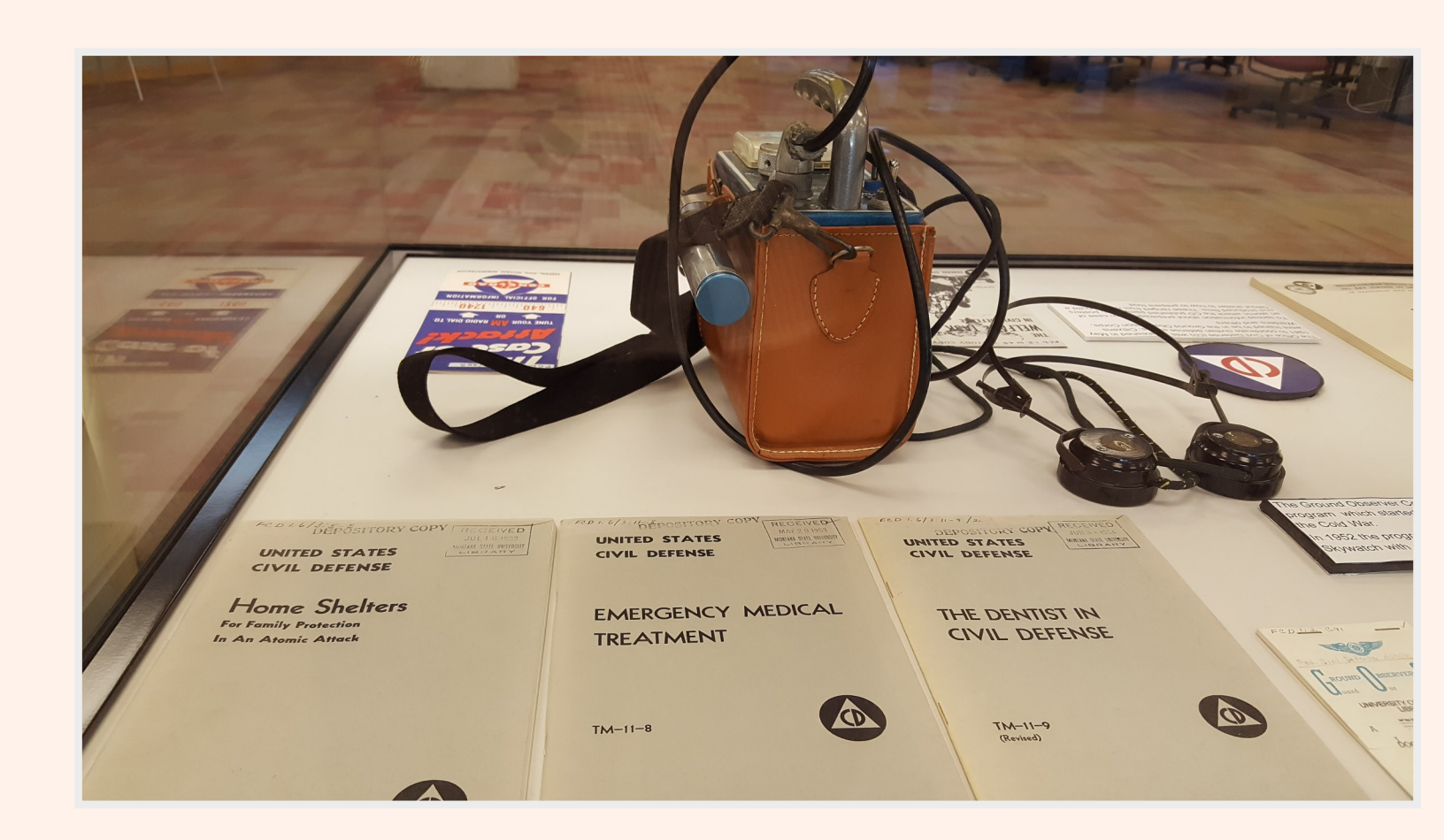
Purpose/goal: The Duck and Cover exhibit was to highlight Civil Defense documents.

Determine the purpose and goal of the exhibit. What do you want people to learn, and how should they interact with the material? If the purpose is to show-case specific government documents, celebrate an event or explore a timely concept, use that as the foundation of the exhibit.