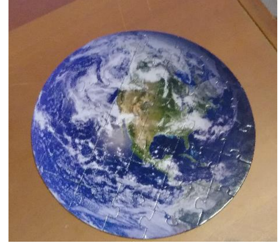
50<sup>th</sup> anniversary of the Apollo 11 Moon Landing, on July 20, 2019