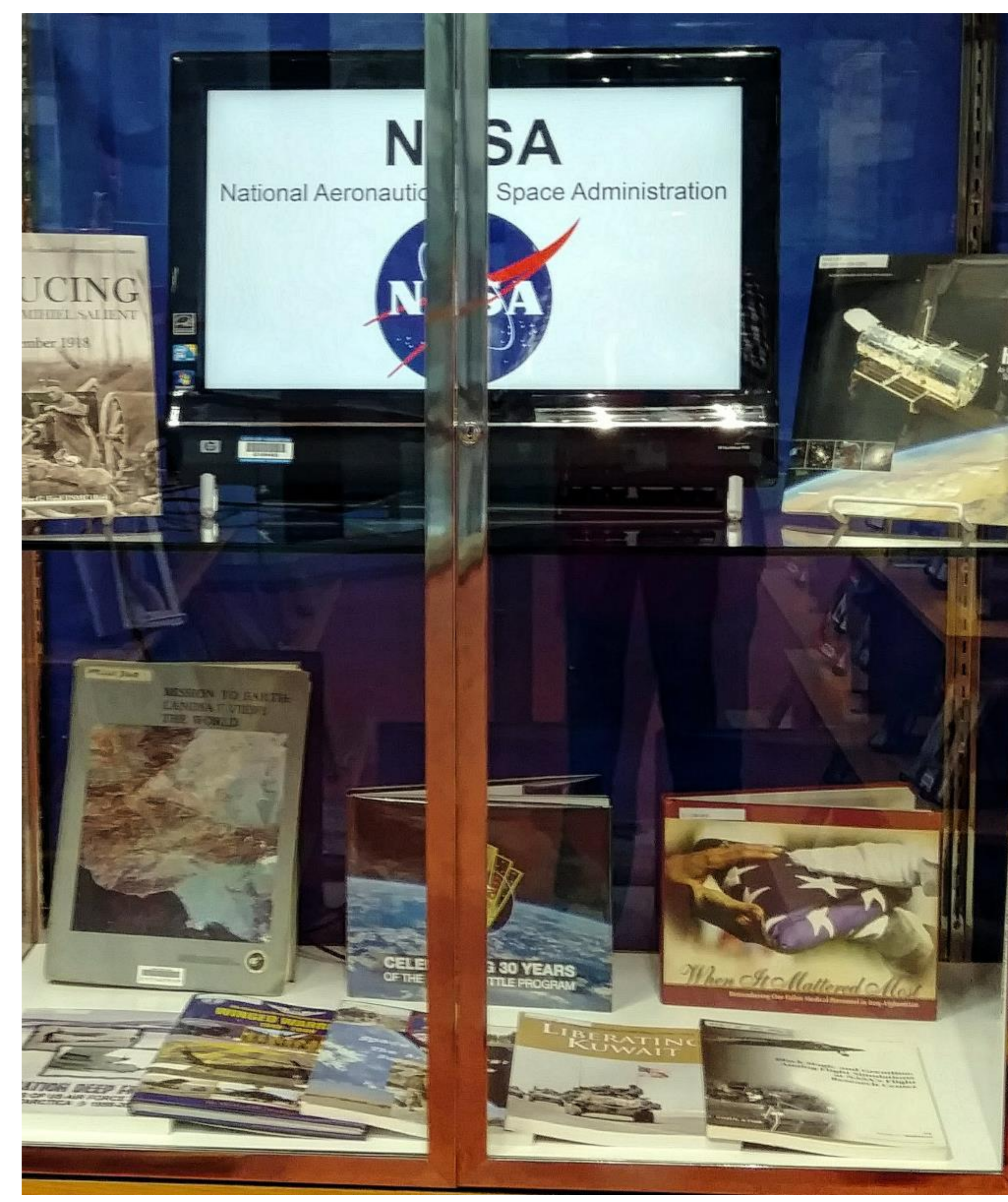
Showcasing government resources for the public with a display of books, flyers and posters.