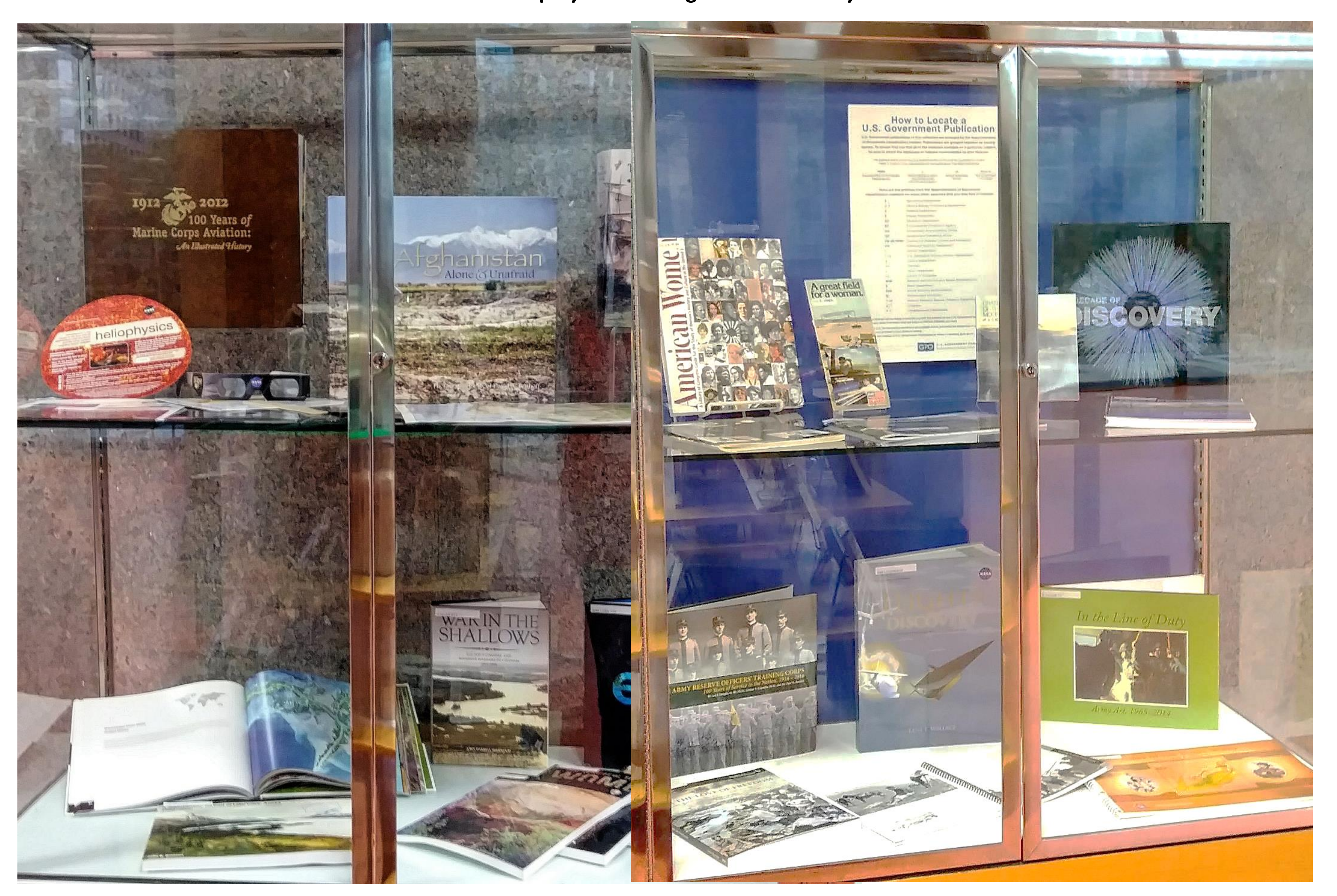
HPL's 135 years in FDLP: Highlighting books, posters & other items published by the GPO on history, military defense & NASA