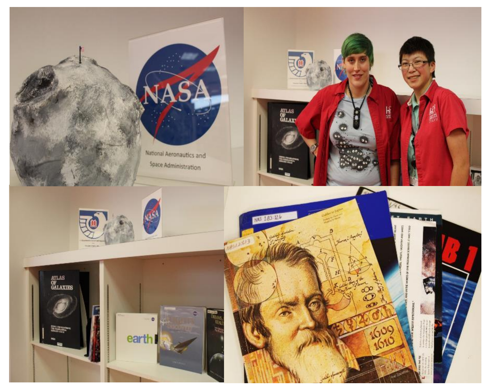
NASA Display in July promoting space, travel and science technology

The Government Documents collection is a closed-stack, noncirculating collection.